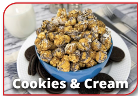
Cookies & Cream