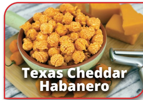
Texas Cheddar Habanero