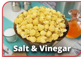
Salt & Vinegar