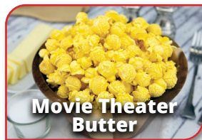
Movie Theater Butter