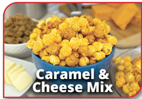
Caramel & Cheese Mix